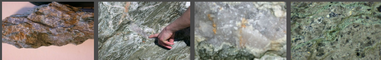
Samples of quartz-tourmaline-arsenopyrite veinlets in carbonate ore zones